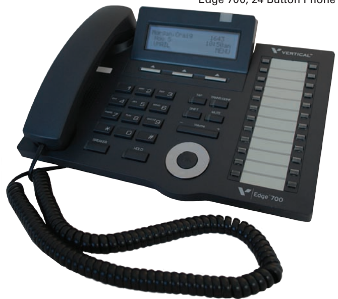
Edge 700, 24 Button Phone

With Wave IP, integrating the dial plans and user data for a network of sites takes minutes. Our unique WaveNet networking application offers intelligent networking of sites that speeds deployment, makes managing dial plan a snap, and provides the redundancy and security you need to manage your network.