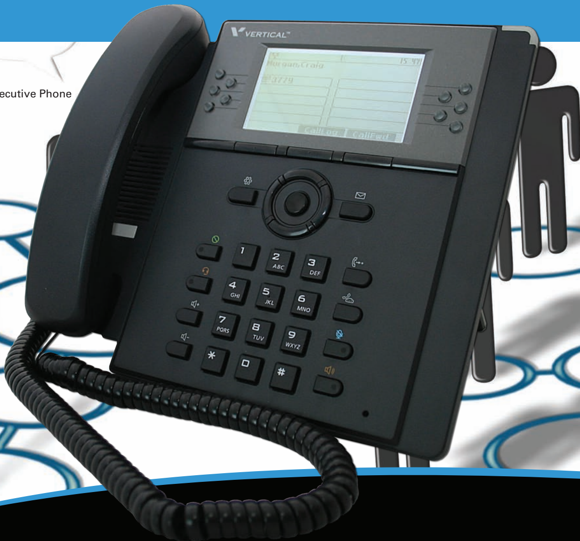
Edge 5000 Executive Phone

Vertical's Wave IP Business Communications Systems deliver simple, powerful business telephony and voice applications that are easy to deploy and use. Wave IP drives increased collaboration and employee productivity, and can substantially reduce operating costs for businesses of any size – from small single-site businesses to large multi-site enterprises. Wave IP integrates desktop and enterprise applications in a streamlined system that is simple to deploy and manage.