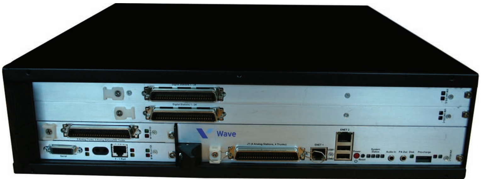
Wave IP 2500 system for HQ and medium offices, supporting up to 500 users.